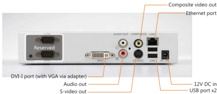
Back Panel Connectors