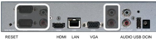
Back Panel Connectors