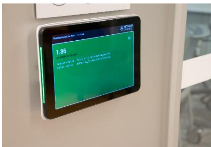
*Monash University's new Learning & Teaching Building

For example, Australia’s Monash University works with IAdea and the room booking platform Concierge to deliver a room availability solution. There are 10-inch wall-mounted units outside rooms, with color coded messaging about the current status of each room: red meaning the room is in use, green for available.