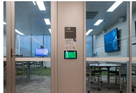
*Monash University's new Learning & Teaching Building

IAdea has more than 300,000 devices in the field through a wide variety of applications and vendor partners, with the largest network involving more than 10,000 screens. IAdea devices are used in more than 50 countries, with North America and Europe-Middle East (EMEA) the largest markets.