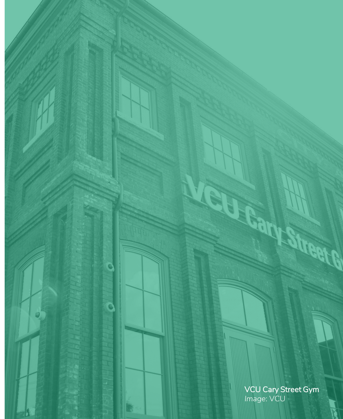
VCU Cary Street Gym