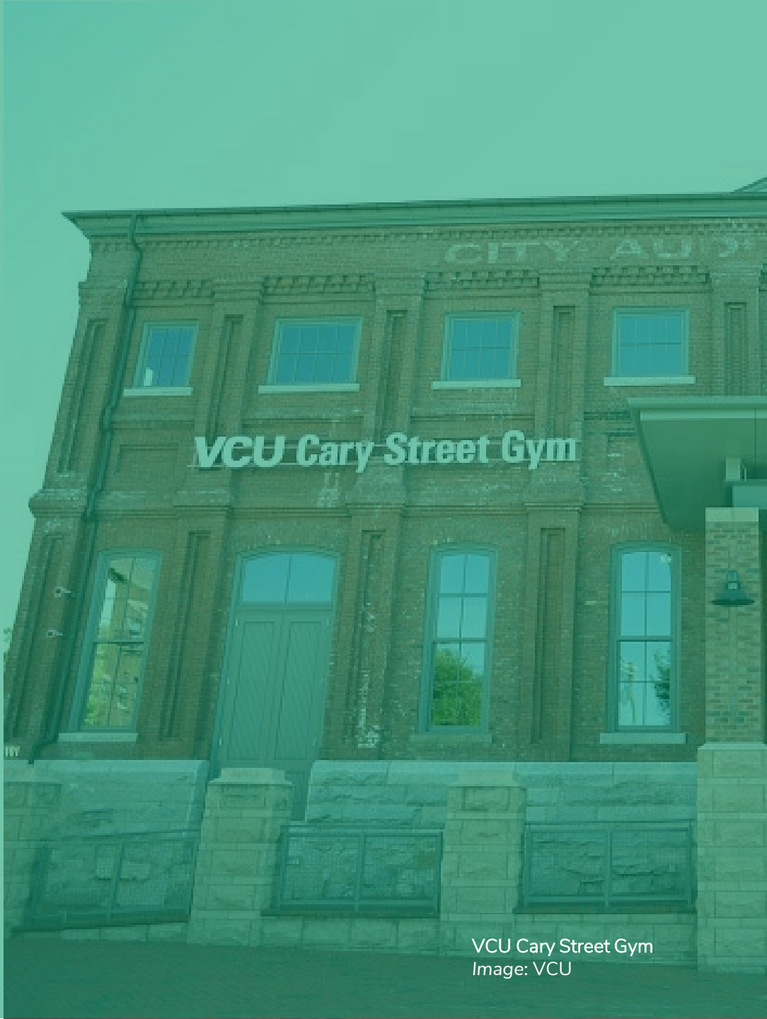
VCU Cary Street Gym