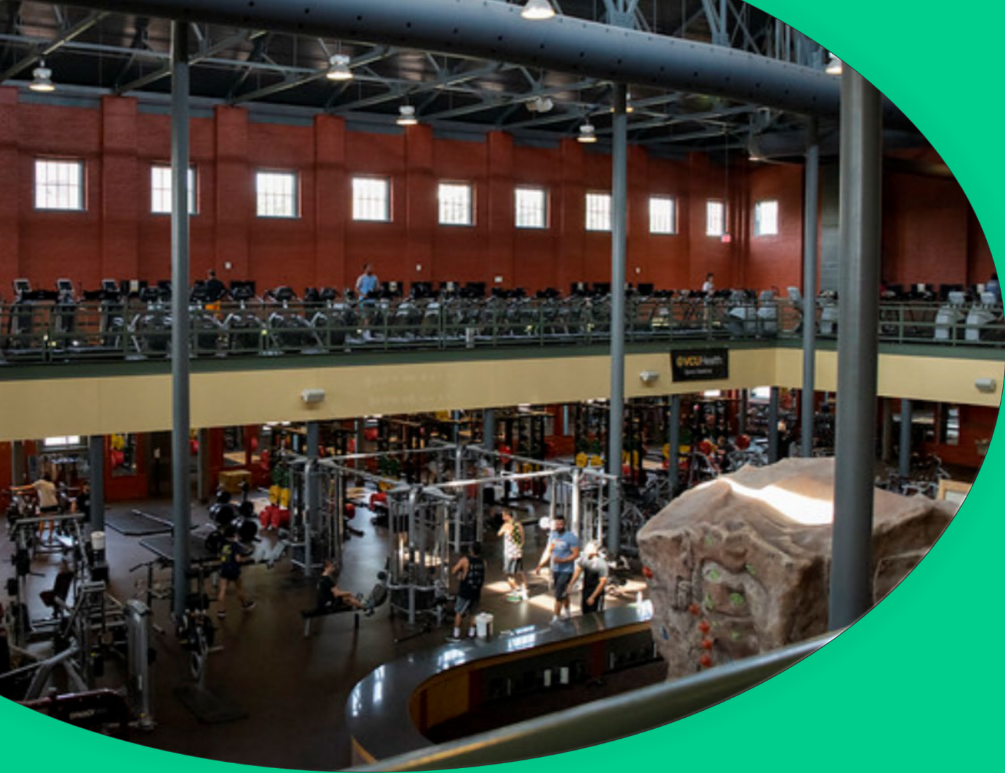
VCU Cary Street Gym