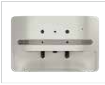
Zero-gap flush VESA mount